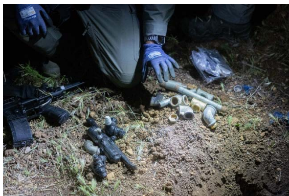
Pipe bombs in al-Jib (Israel Police spokesperson, May 14, 2026)

► Palestinians reported an Israeli security force wave of raids, detentions and searches during which dozens of Palestinians were detained. In Dura, south of Hebron, an operation was reported which included raids on dozens of houses, field interrogations, turning homes into temporary detention centers and the detainment of more than 21 Palestinians. Other detentions were reported in the Ramallah, Tulkarm and Salfit areas; in Jenin, forces reportedly entered a school in Silat al-Thar, removed a "Palestine" flag and conducted raids in Yabad and Bayt Qad; there were reports of extensive activity in Tuqu', Nahalin in the Bethlehem area, in Tulkarm, Qalqilya, Araba and Mithlun in the Jenin area, in Zawata and Tell in the Nablus area, in al-Jadida south of Jenin and in the Shuafat refugee camp in Jerusalem; a Palestinian fatality was reported in the Jenin refugee camp (al-Quds, May 13-16, 2026).