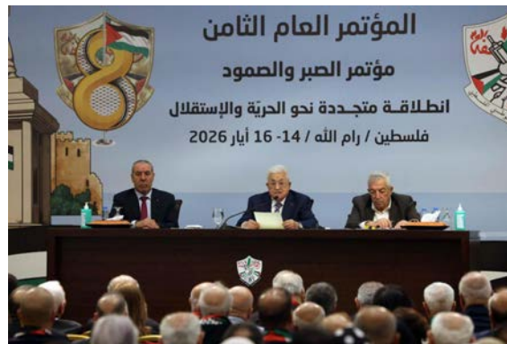
The eighth Fatah conference (al-Quds, May 17, 2026)