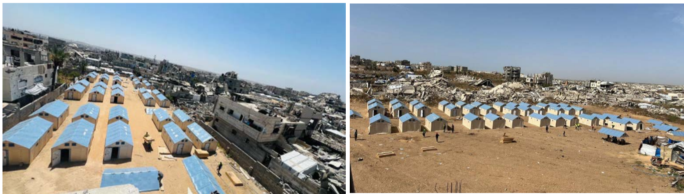
Right: The new tent camp in the northern Gaza Strip (Facebook page of the Palestinian ministry of public works and housing, May 15, 2026). Left: The camp in the al-Sabra area in Gaza City (Facebook page of the Palestinian ministry of public works and housing, May 13, 2026)

► Following reports in the Palestinian media about rodents in the refugee tents, the Israeli Coordinator of Government Activities in the Territories (COGAT) said that in coordination with the UN and international organizations, this past week Israel had transferred to the Strip more than 30,000 cans of insecticides, more than 10,000 cans of mosquito sprays, more than 4,500 rodent traps, more than 1,500 extermination stations and more than 2,500 insect-trapping devices (COGAT Facebook page, May 15, 2026).