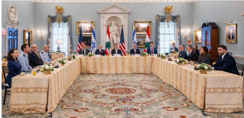
The delegations meet in Washington (Lebanon Debate, May 15, 2026)

authority over war and peace solely to the Lebanese state ( al-Araby al-Jadeed , May 15, 2026; al-Nahar , May 12, 2026; Nidaa al-Watan , May 14, 2026).