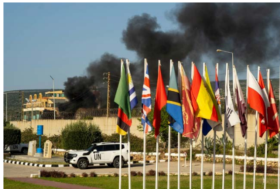
UAV explosion in the UNIFIL headquarters compound (UNIFIL Telegram channel, May 13, 2026)

► UNIFIL said it was becoming concerned by the increasing Hezbollah and IDF activity near UN positions in south Lebanon, particularly after numerous UAV incidents near the force's headquarters in al-Naqoura. UNIFIL said there had been several explosions and crashes of UAVs "suspected of belonging to Hezbollah," some of them within UNIFIL areas themselves, endangering the peacekeeping forces and damaging buildings, although no casualties were reported. Preliminary findings indicated that at least one UAV was Iranian-made. Meanwhile, UNIFIL announced it had conveyed protests both to the IDF regarding its activity near UN positions and to the Lebanese army regarding the activity of "non-state actors" in the area, while calling on all parties not to engage in activity liable to endanger the peacekeeping forces (UNIFIL Telegram channel, May 13, 2026).