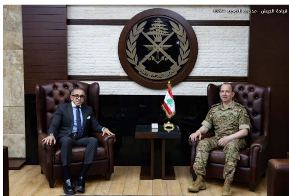
Haykal and the Egyptian ambassador (X account of the Lebanese army, May 16, 2026)

► Commander of the Lebanese army general Rodolph Haykal met with the Egyptian ambassador to Lebanon, Alaa Moussa, to discuss the latest developments in Lebanon and the region. The Egyptian ambassador stressed his country's support for the Lebanese army's efforts to preserve the state's stability and security, given the security and political challenges Lebanon had faced in recent times (X account of the Lebanese army, May 16, 2026).