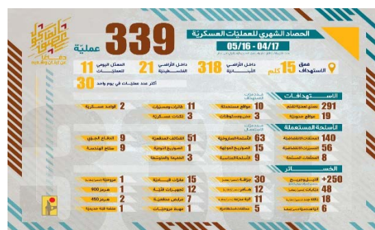
Right: Hezbollah statistics. Left: Map of the attacks (Hezbollah combat information Telegram channel, May 17, 2026)