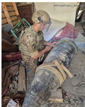
A special forces soldier in the Lebanese army neutralizing a bomb in Beirut (X account of the Lebanese army, May 12, 2026)