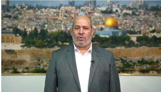
Khalil al-Hayya speaking after the death of his son ( Hamas Telegram channel, May 7, 2026)

war, al-Hayya said that if the Palestinian people were attacked, they would defend themselves (Al Jazeera channel, May 6, 2026).