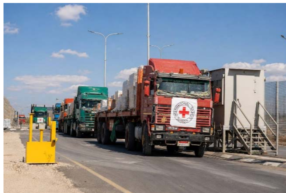
Trucks carrying medical aid that entered the Strip (COGAT Arabic Facebook page, May 7, 2026)

► The Israeli Coordinator of Government Activities in the Territories (COGAT) reported that hundreds of pallets of medical equipment had been transferred to the Red Cross field hospital in Gaza. The supplies included advanced medical systems, equipment for laboratories and treatment rooms, equipment for ventilators, generators, medicines, tents and dozens of new beds. It was noted that the additional equipment and medical supplies would lead to a significant improvement in the hospital's operations, expand the capacity of its hospitalization and treatment departments and improve its ability to provide advanced medical care to a larger number of patients, including in the fields of emergency medicine, surgery, women's health and maternity care (COGAT Arabic Facebook page, May 7, 2026).