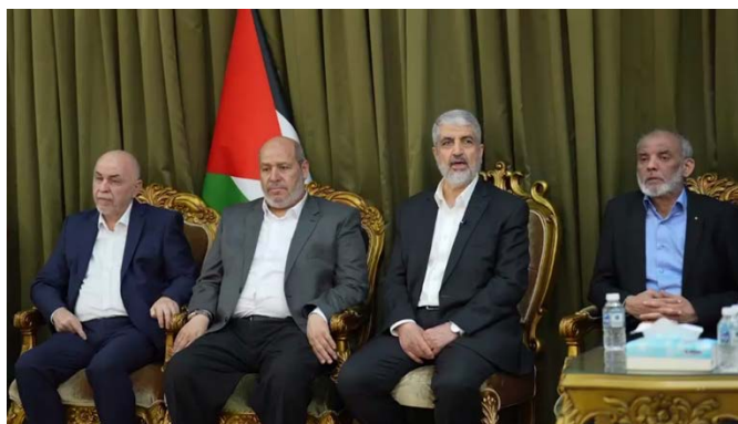
Mashal (second from right) next to al-Hayya at the condolence event

► With the contest between al-Hayya and Mashal for Hamas leadership, Mashal used his remarks at a condolence event in memory of al-Hayya's son to praise his rival. Mashal said that when they met in Jordan in the mid-1990s he identified al-Hayya as "a patient and faithful Muslim with high morals," and denied claims that there were power struggles between them. Mashal said, "Since I met brother Abu Osama [al-Hayya's nom de guerre], I have known his patience, his faith and his character, as well as his family. Allah knows that Abu Osama has a great place in my heart, far from what people believe on social media".