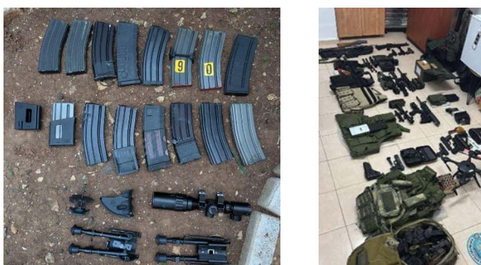
Weapons located in Judea and Samaria (IDF spokesperson, April 29, 2026)

► Israeli security forces continued counterterrorism activities throughout Judea and Samaria and east Jerusalem, detaining more than 80 wanted Palestinians, among them a terrorist who shot at IDF forces. Three lathes for manufacturing explosive devices and weapons, and seven drones and ready-to-use explosive devices were seized. In the village of Arrana, near Jenin, seven ready-to-use explosive devices were located which were intended to be used against Israeli security forces. In the village of Silwad in the Ramallah area, two IDF soldiers were stabbed and superficially wounded by two terrorists during an operational activity. One of the terrorists was shot and killed and the other was detained (IDF spokesperson, April 28–May 5, 2026).