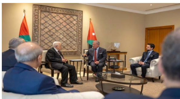
The King of Jordan meets with Mahmoud Abbas (Wafa, April 28, 2026)

► PA chairman Mahmoud Abbas met in Amman with King Abdullah II of Jordan to discuss developments in the Palestinian arena and joint regional and international issues. Abbas praised Jordan's support for the Palestinian cause, the humanitarian assistance it provides to Gaza and its role in the Hashemite custodianship over the holy sites in Jerusalem. He also briefed the king on the "Israeli escalation" in Judea and Samaria and east Jerusalem, the expansion of settlements, annexation attempts and settler violence, and called for the release of Palestinian tax funds held by Israel. They noted the need to maintain the historical and legal status quo of the holy sites in Jerusalem, promote stabilization of the ceasefire in the Gaza Strip, the entry of aid, the transition to the second stage, reconstruction and a two-state solution in accordance with international decisions. Abbas reiterated the "unity" of the Gaza Strip, Judea and Samaria and east Jerusalem under the principle of one state, one law and one legitimate weapon, and presented the Palestinian reform plan for strengthening state institutions, transparency, rule of law, the education system, security, the judiciary and democratic processes. They agreed to continue coordination and consultations between the Palestinian and Jordanian leaderships (Wafa, April 28, 2026).