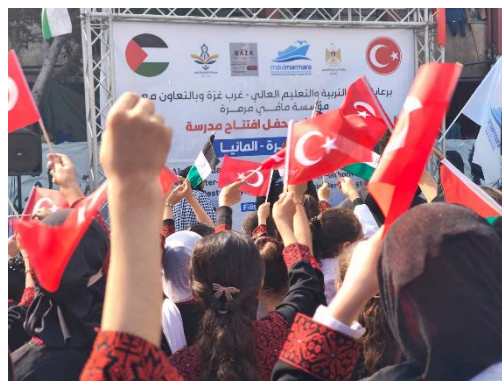
Inauguration of the school

► The COGAT reported that the departure of patients and escorts from the Gaza Strip continued via the Kerem Shalom Crossing, from there to the Allenby Bridge Crossing and onward to Jordan, for medical treatment. Since February 2026, more than 2,000 patients and