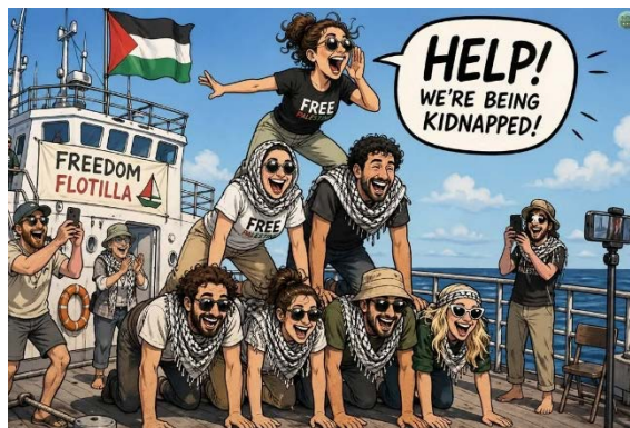
Flotilla activists enjoying life on deck