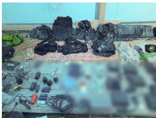
Weapons discovered in the northern Strip (IDF spokesperson, May 3, 2026)

► IDF operations continued within the Yellow Line in the Gaza Strip to locate terrorists and to destroy weapons, tunnels and terrorist facilities and assets. Terrorists who approached IDF forces or who attempted to infiltrate into the Yellow Line region were eliminated. Terrorist operatives who attempted to attack IDF forces were eliminated, among them the head of the operations department in Hamas' military intelligence headquarters who was involved in orchestrating the October 7, 2023 terrorist attack and massacre (IDF spokesperson, April 28–May 5, 2026).