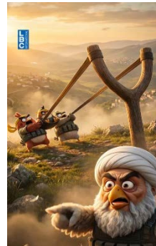
Right: Na'im Qassem in the video (LBCI, May 2, 2026).