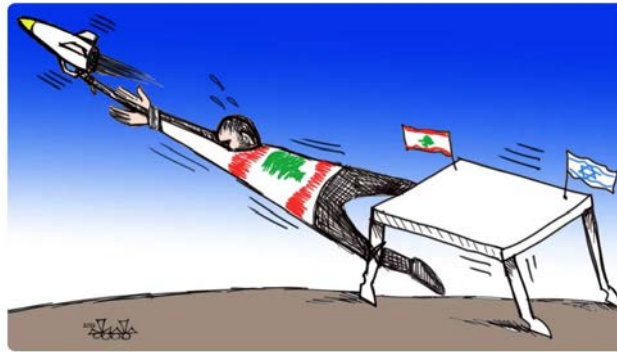
Lebanon trapped between war and arrangement (al-Madan, April 29, 2026)

the return of prisoners and the completion of border demarcation. They said they supported the Salam government and steps to implement the state's monopoly on weapons, strengthen the army and expand state control over all state territory, while condemning Israeli attacks on civilians and infrastructure. They also noted the importance of exploiting international support for the reconstruction of the state, strengthening the economy and maintaining national unity, and strengthening the Arab dimension, especially Saudi support, as a means for stabilizing Lebanon and advancing along a diplomatic path ( al-Sharq al-Awsat , May 2, 2026).