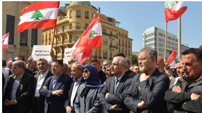
Members of parliament at the protest rally