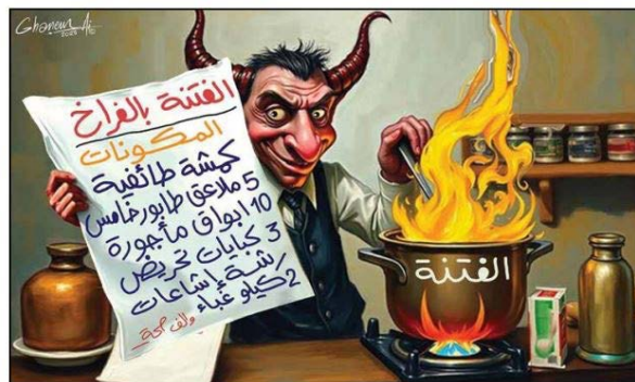
A page with the recipe for internal conflict ( fitna ), its ingredients are sectarianism, sectarian leaders, media, rumors and incitement ( al-Joumhouria , April 30, 2026)