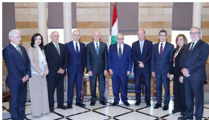
The Sovereign Front in a meeting with Salam (Lebanese prime minister's office X account, April 27, 2026)