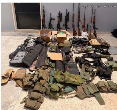
The cache of weapons that was seized in Sidon

► Lebanese army intelligence forces raided a building in central Sidon and uncovered a cache of weapons stolen from an apartment belonging to a senior operative in one of the Palestinian terrorist organizations, part of a broad investigation into a weapons trafficking affair. So far, seven suspects have been arrested, including a former prisoner who was involved in clashes in Sidon in 2013 between supporters of a Salafi Sunni cleric and Lebanese army and Hezbollah forces. The assessment is that the weapons were only part of a larger quantity which was distributed. Reportedly, the investigation focuses on both identifying the amount and types of the weapons and on mapping the distribution network and its destinations, which indicates an ongoing challenge of control over illegal weapons and a potential for undermining internal security stability ( al-Madan , April 30, 2026).