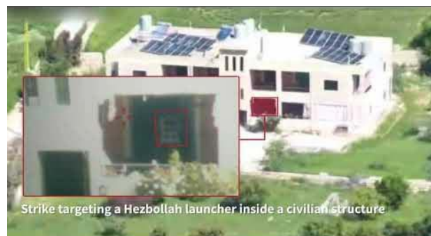
Right: A launcher inside a civilian structure (IDF spokesperson, April 29, 2026). Left: Destruction of a Hezbollah tunnel (IDF spokesperson, April 30, 2026)