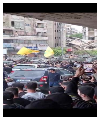
Right: Hezbollah supporters demonstrate in Beirut. Left: Lebanese army forces arrive