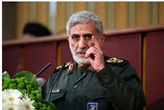
Esmail Qaani (ILNA, April 17, 2026)

► The commander of the Qods Force, Esmail Qaani, praised Hezbollah’s steadfastness in the war with Israel. In a message published following the ceasefire in Lebanon, Qaani wrote that the Lebanese people are the victors in the decisive arena of the heroic Hezbollah. He added that if a permanent ceasefire is achieved, it is the result of the steadfastness of the “resistance” in Lebanon and the support of the Islamic Republic of Iran. According to him, there are those who seek to impose humiliation on the honorable Lebanese people, but Hezbollah’s standing proves the refusal of humiliation (ILNA, April 17, 2026).