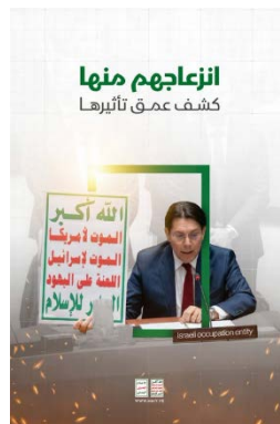
A Houthi poster showing Israel’s ambassador to the UN, Danny Danon, holding a sign with the Houthi movement’s motto under the caption: “Their discomfort with it has exposed the depth of its influence” (Telegram channel of the Houthis’ combat information, April 23, 2026)

► Houthi Defense Minister Mohammed al-Atifi declared that the “Yemeni security forces” are in high readiness to deal with any “aggression” against the “Yemeni people.” He also said that the latest round of confrontation with the “Zionist and American enemy” embodied the unity of the fronts and proved the effectiveness of the military operations of the “axis of jihad and resistance” against the “enemy” and exposed the “weakness and fragility” of the American bases in the region (Telegram channel of the Houthis’ combat information, April 18, 2026).