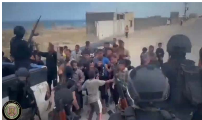
Militia fighters with displaced persons in an area under Hamas control (Khan Yunis channel discussions Telegram Channel, April 27, 2026)

► Hamas "resistance" security stated that an attempt by "collaborating gangs" to carry out a "terrorist operation" at al-Aqsa Martyrs Hospital in Deir al-Balah was foiled. Hamas claimed that operatives of the "gangs" intended to use a group of civilians as human shields to storm the hospital and kidnap wounded persons in order to hand them over to Israel, under the direction of Israeli intelligence. "Resistance" security also claimed that an Israeli intelligence agent was arrested who admitted to photographing the hospital rooms of the wounded (al-Akhres Telegram channel, April 22, 2026).