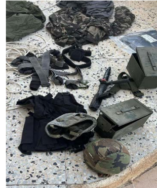
Equipment found in the terrorist's house (IDF spokesperson, April 18, 2026)