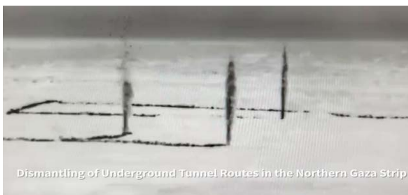
The IDF destroys Hamas terrorist tunnels in the northern Gaza Strip (IDF spokesperson, April 27, 2026)

► IDF forces continued their activity within the Yellow Line in the Gaza Strip to locate terrorist operatives and destroy weapons, tunnels and other terrorist infrastructure. Four Hamas tunnels in the northern Gaza Strip were destroyed, with a total length of about 800 meters, with living quarters, sleeping equipment, explosive devices and materials used for preparing explosive devices. Operatives who approached IDF forces or attempted to infiltrate the Yellow Line were eliminated. Hamas and Palestinian Islamic Jihad (PIJ) terrorists preparing to attack were eliminated, including operatives involved in the October 7, 2023 attack and massacre, and Hamas operatives working to rearm the military wing were also eliminated (IDF spokesperson, April 14-28, 2026).