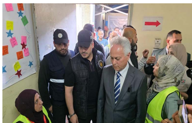
Hamas police secure the voting in Deir al-Balah

► An investigation in Britain found that children in the Gaza Strip were being sexually harassed by clerics affiliated with Hamas, and in many cases threats and extortion were used to keep them and their families from exposing the crimes, or to force them to join Hamas. The investigation presented testimonies of children and fathers who claimed that the abuses took place in mosques, but when they tried to complain they were threatened by Hamas members and operatives of the Izz al-Din al-Qassam Brigades, the Hamas military wing, who threatened to accuse them of collaborating with Israel. Sources in the Strip noted that pedophilia was known, and that in most cases orphans and widows were harassed. It was noted that journalists reporting the situation were pressured and harassed by Hamas ( Daily Mail , April 26, 2026).