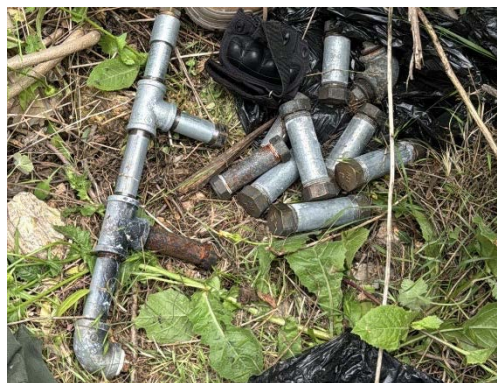
IEDs found in Beit Ummar (IDF spokesperson, April 20, 2026)

► Israeli security forces continued activity to prevent terrorism throughout Judea and Samaria and in east Jerusalem. Dozens of wanted persons and suspects involved in terrorist activity were detained, including Hamas and PIJ operatives, rock- and Molotov cocktail-throwers, arms dealers, individuals involved in incitement and illegal residents. Weapons were seized, including explosive devices hidden in a school in the village of Beit Ummar in the Hebron area, and more than 100,000 shekels intended for financing terrorist activity through charitable associations linked to Hamas were confiscated. In the village of Beit Duqu, a terrorist who threw rocks at an IDF force was eliminated, an Israeli child was superficially injured by rock-throwing on Route 60, and suspects fled after attempting to run over IDF soldiers operating in the village of Burqa. The smuggling of weapons across the Jordanian and Egyptian borders was prevented (IDF spokesperson, Israel Police spokesperson and Israeli media, April 14-28, 2026).