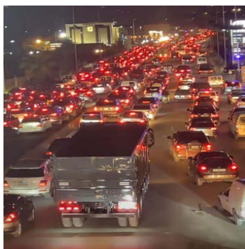
Traffic jam of vehicles bound northward from Tyre

► Reportedly, residents in areas less affected by the fighting began returning to their homes contrary to Hezbollah instructions, increasing criticism of the organization, with claims that it was trying to obscure the extensive destruction on the ground. Hezbollah's opposition to negotiations and fear of renewed fighting were perceived as factors prolonging the population's displacement and increasing its distress. According to claims, the overall picture was of erosion of Hezbollah's public legitimacy in south Lebanon, and a rise in a sense of helplessness and fear that the displacement would become permanent ( al-Liwaa , April 21, 2026).