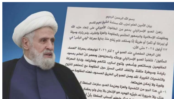
Na'im Qassem's open letter (al-Manar, April 27, 2026)

◆ In an open letter, Hezbollah secretary general Na'im Qassem said that despite the "sacrifice, honor and defeat of the enemy [ s'ic ]," the Lebanese authorities rushed into a useless and humiliating concession by entering direct negotiations. He reiterated his position that the solution was stopping the "aggression," Israel's withdrawal from the "occupied" territories, the release of Lebanese prisoners held in Israel, the return of the displaced and reconstruction. He added that the "resistance" was a "response to aggression" and not the cause, and its weapons were meant only to repel "aggression" and prevent the "occupation of Lebanon as part of Greater Israel," and therefore the "resistance" would not disarm and was prepared for a Karbala-style battle [a battle to the death]. He thanked Iran, which he claimed was responsible for the ceasefire, and wondered why the government stubbornly refused to accept Iranian involvement. He said he hoped the government would "retract its violations," adding that the direct negotiations did not interest Hezbollah in the least (Hezbollah combat information Telegram channel, April 27, 2026).