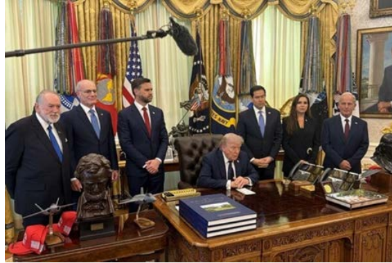
White House figures with the Israeli and Lebanese ambassadors ( al-Nashra , April 22, 2026)

Lebanese delegation continued to operate through a direct diplomatic channel under American auspices ( al-Nahar , April 24, 2026).