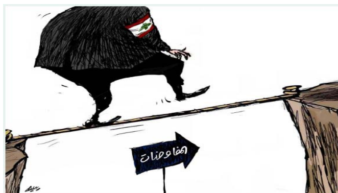
Lebanon walks a tightrope over an abyss on the way to negotiations ( al-Sharq al-Awsat , April 21, 2026)

◆ Head of the Free Patriotic Movement, Gebran Bassil, sharply criticized Hezbollah and said it had dragged Lebanon into two rounds of fighting to serve external interests, support for the Gaza Strip and Iran, with no national benefit for Lebanon. He said they had damaged the organization's internal legitimacy, since they were perceived as the decisions of an external agenda and unrelated to Lebanese considerations ( al-Nashra , April 23, 2026).