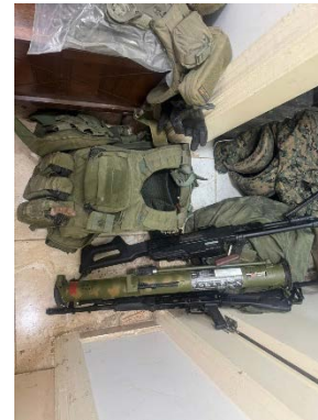
Right: Military equipment confiscated in south Lebanon (IDF spokesperson, April 14, 2026. Left: The Israeli flag and the Paratrooper flag flown in the stadium in Bint Jbeil (Lebanon Debate, April 22, 2026)