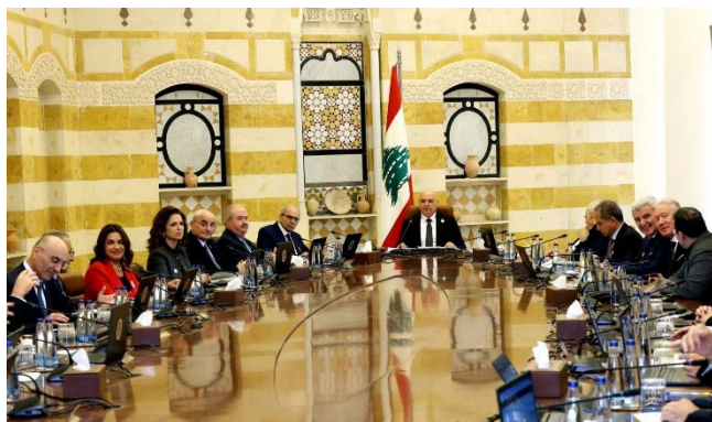
Lebanese government meeting headed by President Aoun (X account of the Lebanese presidency, April 23, 2026)

► At a cabinet meeting Aoun said contacts with the American administration focused on a ceasefire and launching negotiations for ending the state of war, Israeli withdrawal, the return of prisoners, deployment of the Lebanese army to the international border and discussion of disputes surrounding the Blue Line. He said he had no intention of holding direct talks with Netanyahu, contrary to incorrect reports in the media. He said the return of the Lebanese File to the American table was a strategic opportunity for economic recovery and reconstruction, and adding that he hoped to meet with the American president. He noted his commitment to addressing ceasefire violations and the internal public pressure to end the fighting, mentioning the growing fatigue of the Lebanese public and bereaved families with the continued confrontation (X account of the Lebanese presidency, April 23, 2026).