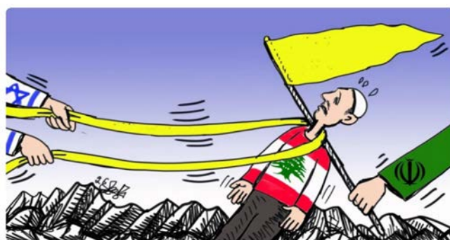
Lebanon in a tug of war between Israel on one side pulling along the Yellow Line, and Iran on the other, pulling through Hezbollah (al-Madan, April 22, 2026)

► On April 26, 2026, Hezbollah claimed that the attacks on IDF forces in south Lebanon and "settlements in northern occupied Palestine" were [allegedly] a "legitimate response," while accusing Israel of carrying out more than 500 "violations" since the beginning of the ceasefire. Hezbollah accused the Lebanese authorities of not demanding an end to the "aggression" as a condition for continuing the talks with Israel, thereby "encouraging the enemy to continue the aggression." Hezbollah also accused the Lebanese authorities of not fulfilling their basic national duties and only watching as "the enemy destroys homes, burns crops and land." Hezbollah warned that "continued violations " would be met with "resistance and defense," and that they would not "wait or gamble on failed diplomacy" or on a "government that hesitates to defend its homeland" (Hezbollah combat information Telegram channel, April 26, 2026). Sources stated that Hezbollah's statement was not only a declaration of war against Israel but also an attack on the State of Lebanon itself, it increased concern over the collapse of the ceasefire. According to the report, Lebanon's president, Joseph Aoun, was in continuous contact with representatives of the American government to prevent further escalation, and the Americans promised to monitor the issue ( Nidaa al-Watan , April 27, 2026).