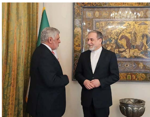
The Iranian foreign minister and the Iranian ambassador to Lebanon (Iranian Embassy in Lebanon, X post, April 10, 2026)

► Iranian Foreign Minister Abbas Araghchi spoke by phone with Mohammad-Reza Raouf Sheibani, Iran's ambassador to Beirut, who was expelled by the Lebanese government and refused to leave the country after the deadline on March 29, 2026. The two discussed the Israeli strikes in Lebanon and the latest developments in the military and political arena in the country. Araghchi condemned the strikes and emphasized Iran's support for the “legitimate resistance in Lebanon” against Israel. Furthermore, the foreign minister noted that the understandings regarding the ceasefire between Iran and the United States also include Lebanon, emphasizing the need to stop Israel's strikes and the duty of the United States to fulfill its commitments in this regard (Iranian Embassy in Lebanon, X post, April 10, 2026).