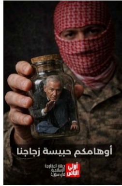
Poster attached to the announcement (Telegram channel of the Islamic Resistance Front in Syria, March 28, 2026)