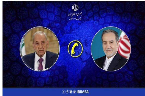
Phone call between Araghchi and Berri (Iranian Foreign Ministry website, March 28, 2026)