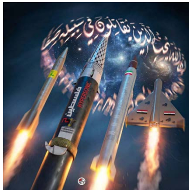
Illustration of a joint launch by Iran, the Houthis, Hezbollah, and the militias in Iraq (Sabereen News, March 28, 2026)

► On March 28, 2026, the Houthi military spokesman, Yahya Saria, announced that they had launched a barrage of ballistic missiles toward “sensitive targets” in southern Israel, “in coordination” with Iran and Hezbollah. This was the first Houthi claim of responsibility for an attack against Israel since October 2025, when they halted operations following the Gaza ceasefire. This is also their first attack since the outbreak of the military campaign between Iran, Israel, and the United States. By March 30, 2026 (12:00), Saria issued an additional claim of responsibility for an attack using cruise missiles and drones against “vital and military sites of the Zionist enemy” in southern Israel (Yahya Saria’s Telegram channel, March 28–30, 2026). It was reported that the launches toward Israel included a ballistic missile, a cruise missile, and a drone from Yemen, and that they were intercepted by the IDF (Israeli media, March 28, 2026). The IDF Spokesperson also reported that two additional drones launched from Yemen were intercepted, although the Houthis had not yet claimed responsibility for them (IDF Spokesperson, March 30, 2026).