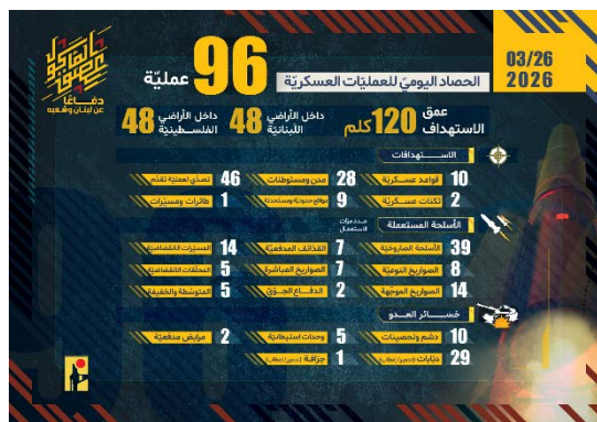
Hezbollah's 96 claims of responsibility (Hezbollah combat information Telegram channel, March 27, 2026)