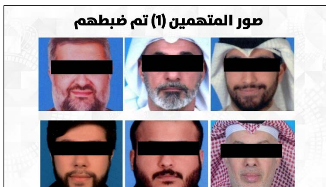
The individuals involved in the Hezbollah terrorist network