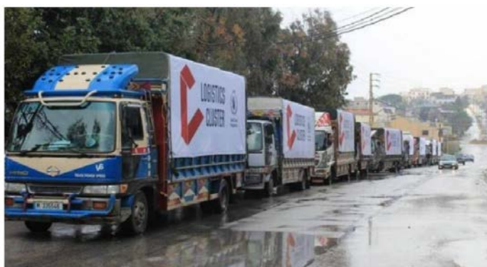
The aid convoy (al-Diyar, March 27, 2026)

► The World Food Programme (WFP), with contributions from several international organizations, delivered an aid convoy of 15 trucks loaded with humanitarian equipment to the Christian villages in the Marjayoun district. The aid included large quantities of food, personal hygiene items, drinking water, blankets, mattresses and basic kitchen utensils. The organizers said the convoy was the first step of a comprehensive humanitarian emergency plan, and that additional shipments would be sent in the coming days to cover other areas to support the affected population (al-Diyar, March 27, 2026).