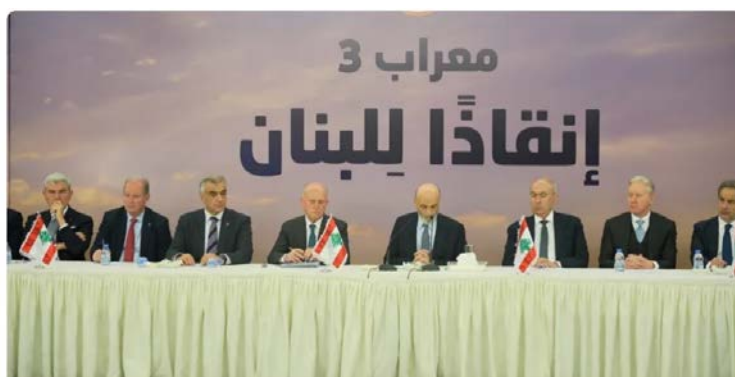
The "For the Salvation of Lebanon" conference (al-Madan, March 28, 2026)