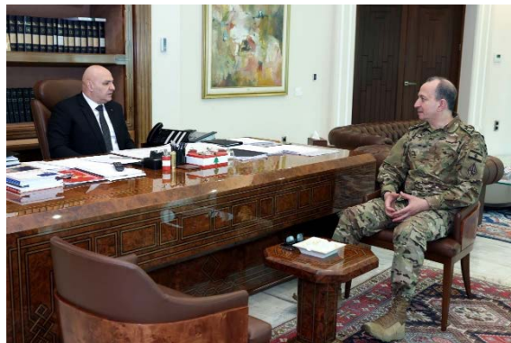
Aoun and Haykal (X account of the Lebanese presidency, March 23, 2026)

particular. Aoun requested security measures be reinforced in the various areas of Lebanon, especially Beirut, to ensure the safety and security of the hosting centers (X account of the Lebanese presidency, March 23, 2026).