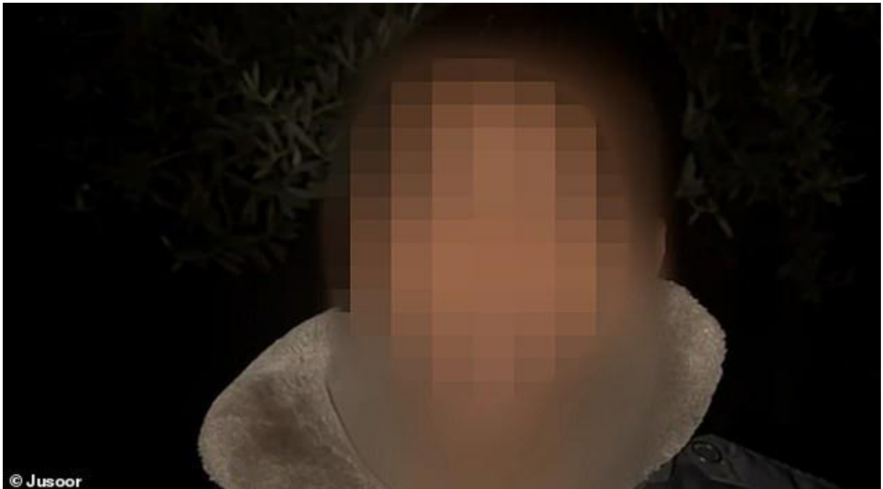
One man, who identified as being in the Qassam Brigades, was told to 'keep quiet' by leadership after he reported that women were being raped by Hamas fighters