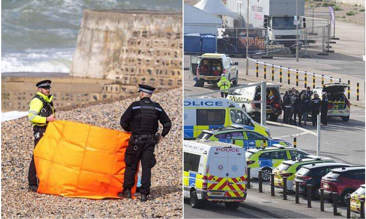
Women who died in sea had 'attended student night' at nightclub

The Izz ad-Din al-Qassam Brigades is the military arm of Hamas.