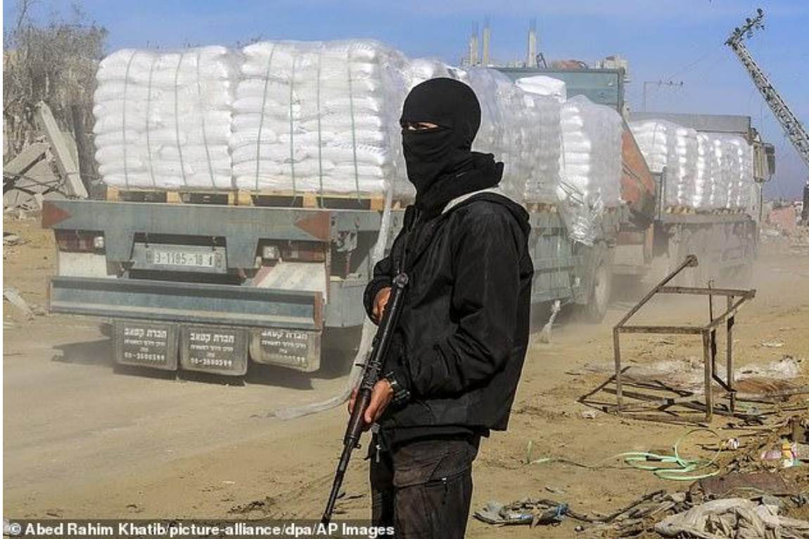
A Palestinian militant stands guard as trucks loaded with humanitarian aid enters the Gaza Strip, January 25, 2025

He warned many victims remain silent due to stigma and fear of social consequences.