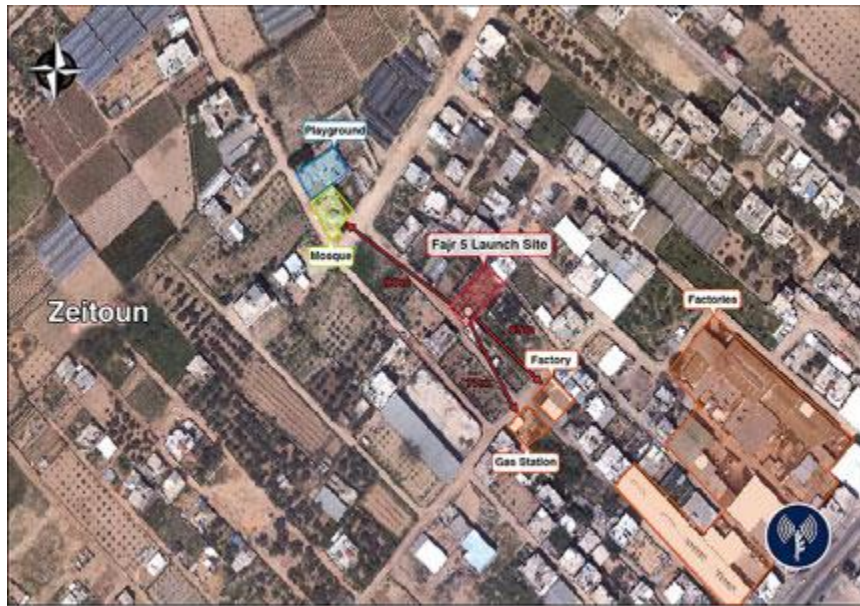
Underground Fajr 5 rocket launching site owned by Hamas in Zeitoun.