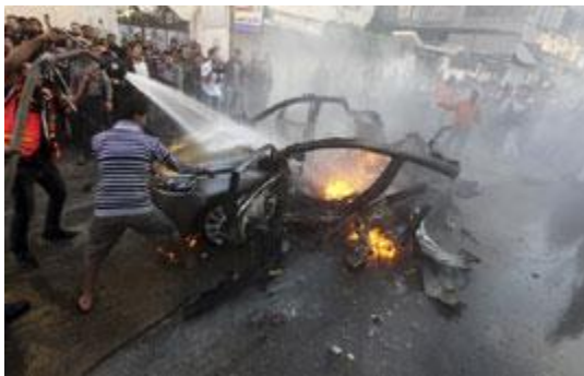
Hamas military head Jabari killed in pinpoint attack

Over the course of Operation Pillar of Defense, the IDF targeted over 1,500 terror sites including 19 senior command centers, operational control centers and Hamas' senior-rank headquarters, 30 senior operatives, damaging Hamas' command and control, hundreds of underground rocket launchers, 140 smuggling tunnels, 66 terror tunnels, dozens of Hamas operation rooms and bases, 26 weapon manufacturing and storage facilities and dozens of long-range rocket launchers and launch sites.