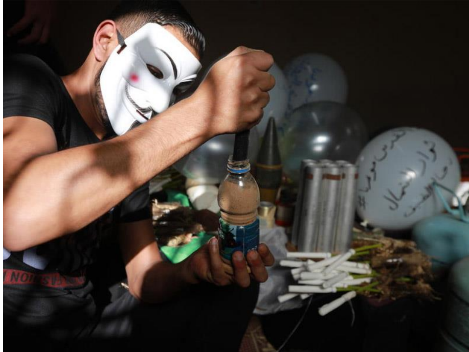
Hamas terrorist preparing an arson balloon in the Gaza Strip, prior to launching into Israel.