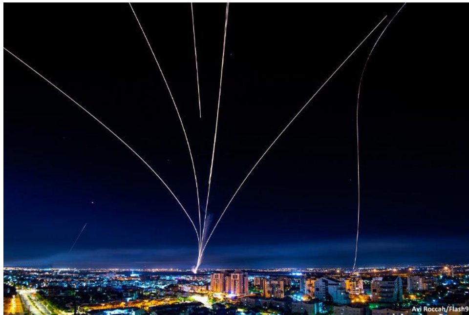
Iron Dome intercepting Hamas rockets over Ashdod.

Prior to the strike, the IDF provided advance warning to civilians in the building and provided sufficient time for them to evacuate the site.