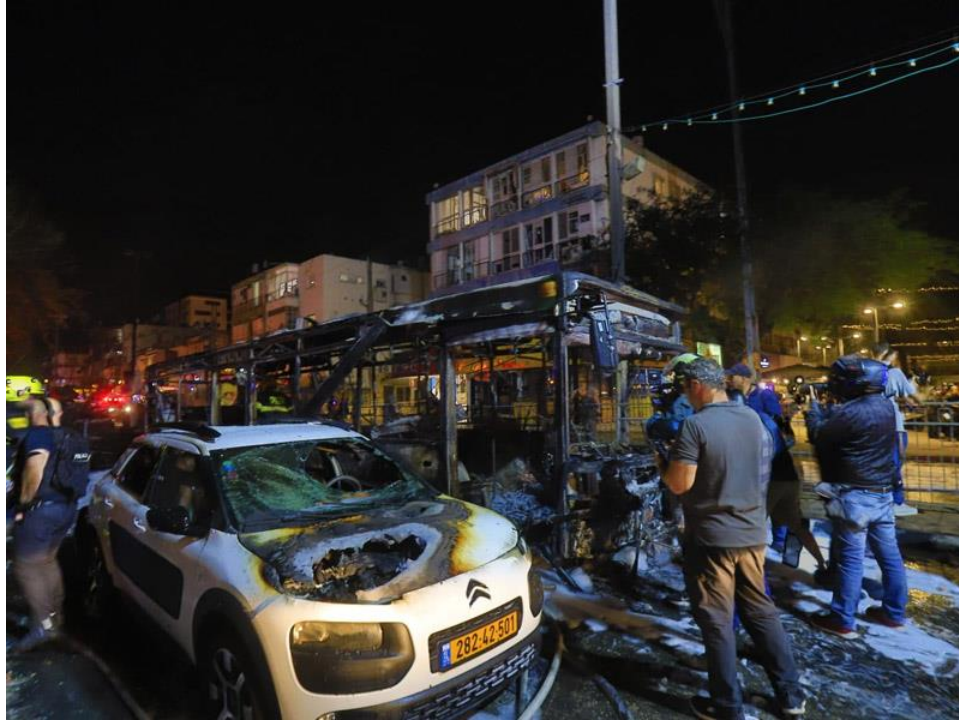
Damage in Holon caused by a rocket attack from Gaza. Three were injured in the attack.

Since the beginning of the attacks on Monday (10 May, 2021), thousands of rockets have been launched by the Iranian-backed Hamas terror organization from the Gaza Strip towards Israeli towns and cities, including the capital of Israel, Jerusalem.