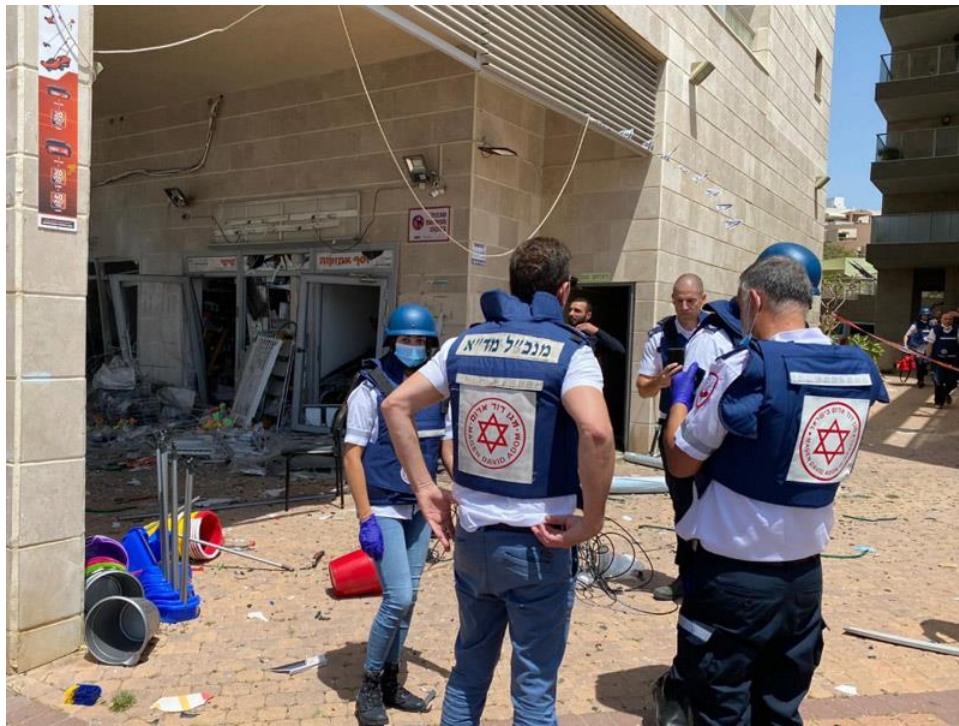
Magen David Adom emergency teams at the scene of a Hamas rocket attack.

Publish Date: 10.05.2021 Updated date: 21.05.2021